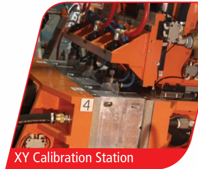
XY Calibration Station

Call R&B Plastics Machinery to learn how the Rotary Indexing Wheel System can boost efficiencies at your plant at 734-864-9421 or FAX: 734-429-1805.