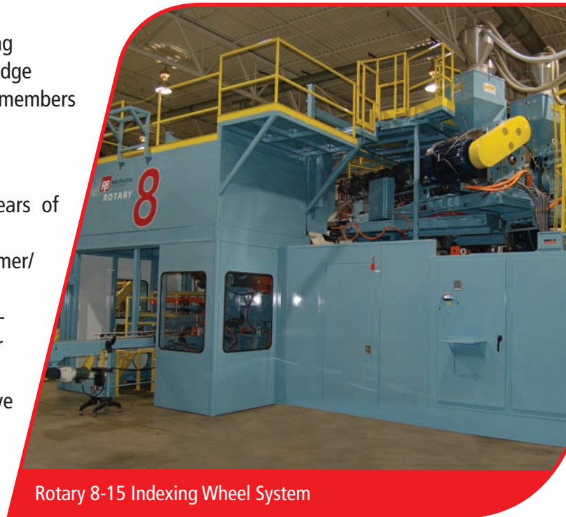
Rotary 8-15 Indexing Wheel System