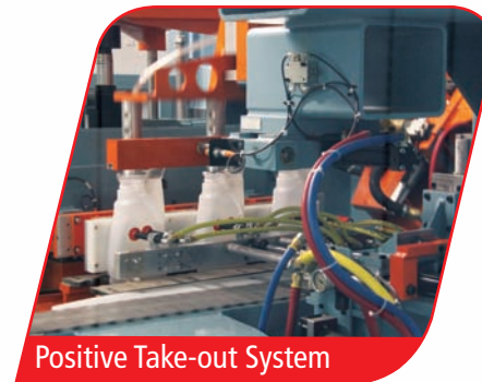
Positive Take-out System