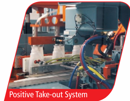
Positive Take-out System